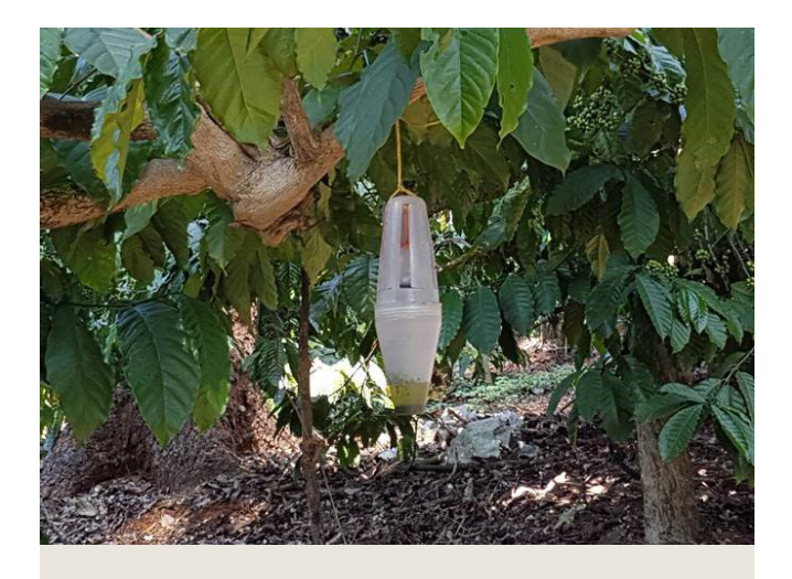
Pheromone traps to control coffee berry borer in Peru.