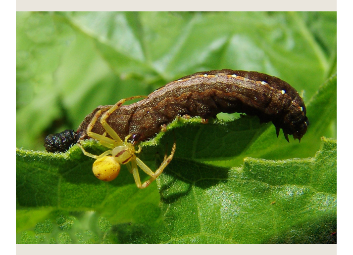
A spider predating a caterpillar pest.