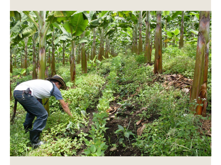
Shade trees help to prevent pests and diseases on crops by providing the right micro climate.