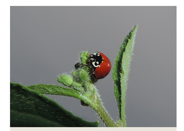
Ladybird beetle (coccinelid) predator.

The Rainforest Alliance's IPM strategy involves deploying its IPM knowledge bank to create context-specific solutions; promoting participatory IPM training via effective methods such as Farmer Field Schools; and lobbying and advocating for shared responsibility in pesticide use. We believe that a sound understanding of local conditions and contexts, combined with solid IPM strategies, can result in a cleaner environment and healthier people—as well as increased profit for farmers. All actors in the food supply chain—producers, processors, pesticide distributors, extensionists and trainers, exporting and importing companies, food retailers, governments of both producing and consuming countries, research institutions, and not-for-profit and community organizations—have a shared responsibility to contribute to making resilient, sustainable, and safe food production a reality.