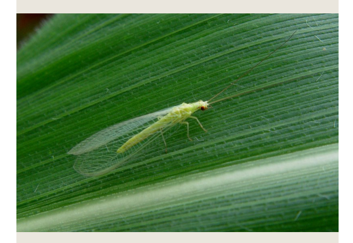
Adult of Chrysoperla externa, a predator.