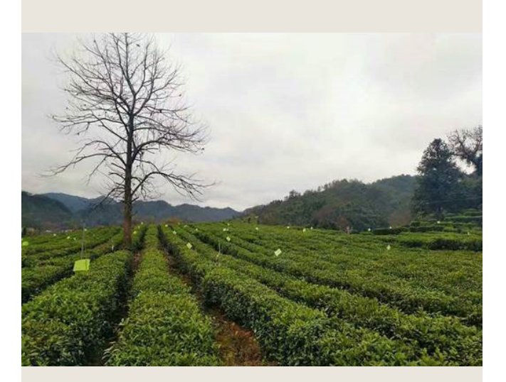
Mechanical pest control: sticky traps on tea plantation in China.