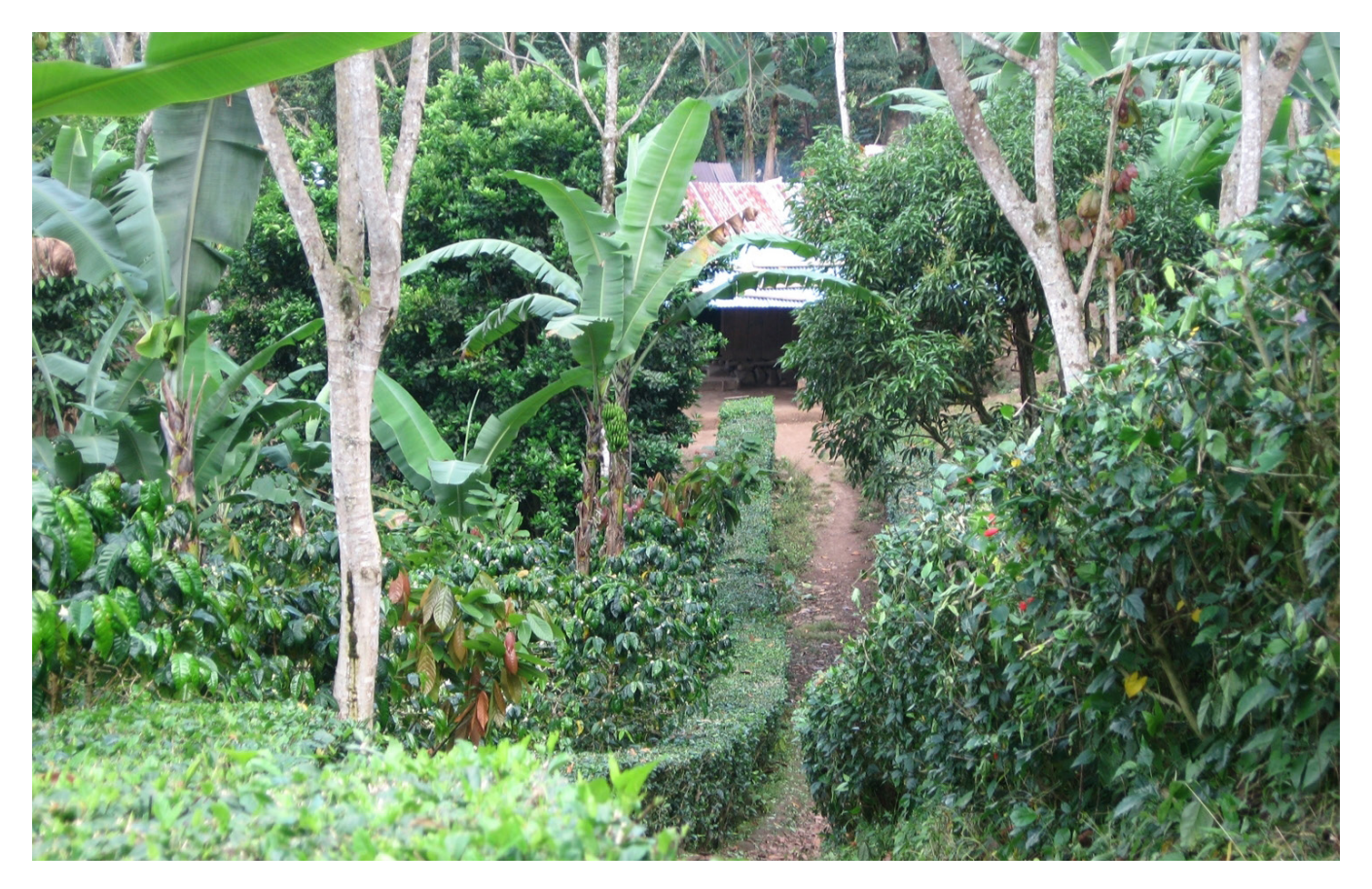
A farm in Waslala, Nicaragua supporting a wide variety of productive species which includes citrus, banana, mango, cacao, coffee as well as laurel tree for timber and Inga for firewood. Such complex agro-ecosystems deliver services like pollination and natural pest control.

IPM is an ecosystem approach to crop production and protection that combines different management strategies and practices to grow healthy crops and minimize the use of pesticides. It is defined by the Food and Agriculture Organization (FAO) as "the careful consideration of all available pest control techniques and subsequent integration of appropriate measures that discourage the development of pest populations and keep pesticides and other interventions to levels that are economically justified and reduce or minimize risks to human health and the environment."<sup>7</sup>